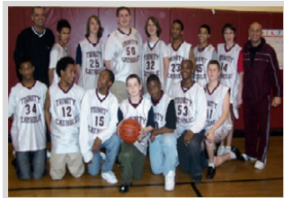
Competitive Sports Teams