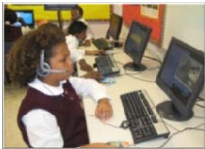
Cutting –Edge Technology