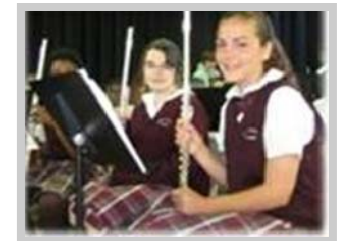
Award Winning Band