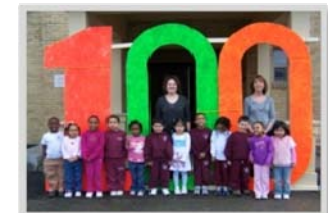
Lower Campus Celebrates the 100th Day of School